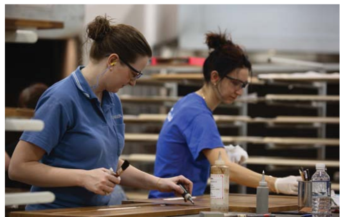
Pictured: Specialty and finishing departments create custom products and quality finishes.