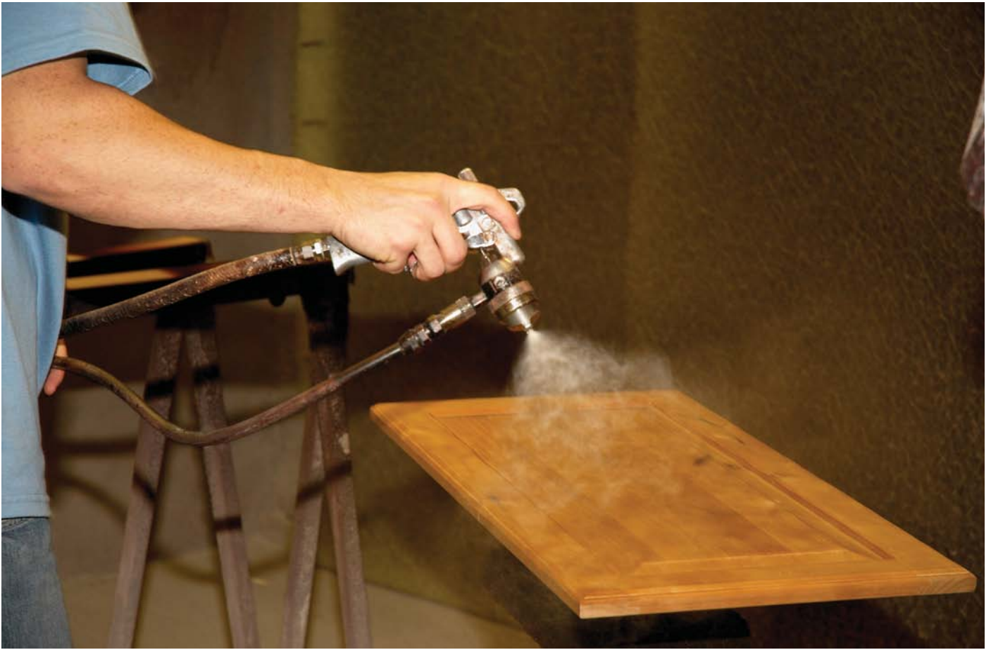
Pictured: A high level of skill and expertise goes into making cabinets at Decor Cabinets.

Due to customer demand, the company shifted its focus in 1985 to high quality custom frameless products with full access cabinetry. At that time, it was a big change for Decor's 30 employees. The company produced framed and frameless products for the next year and then moved exclusively into frameless production. This shift triggered a growth surge, and in 1990 Decor moved to its current 160,000-square-foot location in Morden, Manitoba.