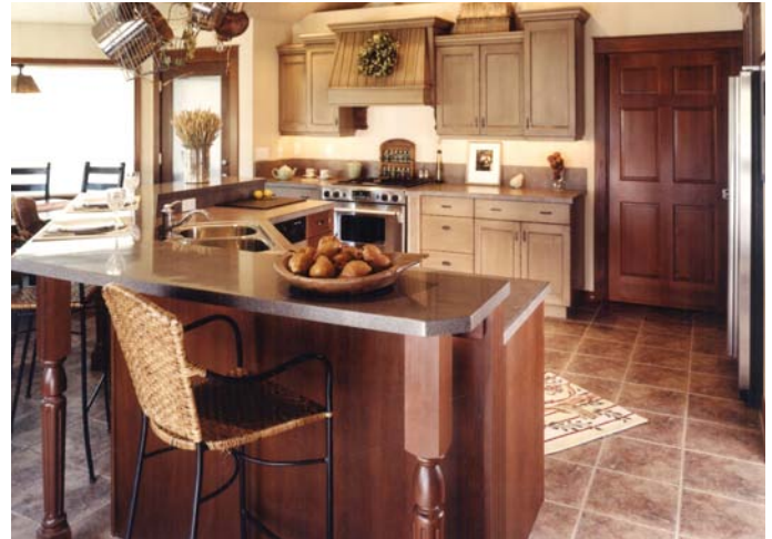
Pictured: Outstanding custom cabinetry that is beautiful and functional.

mine the wage scale for employees based on meeting certain productivity criteria.